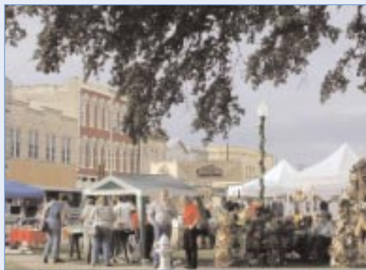
Downtown Winterfest activities and vendors attracts visitors for family fun.

Colorful events in Gonzales will add entertainment to the pre-holiday season. Activities will include a parade of historic homes, Piano Gala, Courthouse Book Fair, Stars in the Village, Breakfast with Santa, History Show, and Courthouse Trade Days—all part of the fun and excitement of the Gonzales Winterfest 2004. Events take place on Dec. 2-5.