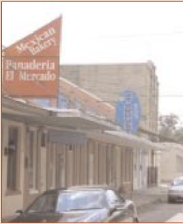
Two views of recently renovated downtown streets.

Other businesses new to the downtown area include: The Josephine Peck Black Art Center, Gonzales School of Dance, Heads Black Belt Academy, Apache Title Co., Hearty Gourmet, Greg's, Starry Nights Café, Shear Designs Boutique and Licorice and Lemon Drops. Remember to shop Downtown Gonzales.