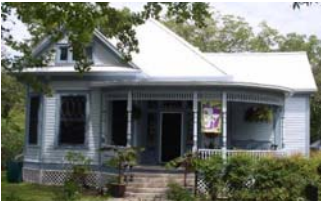
W.T. Dawe House - 1907 724 N. College